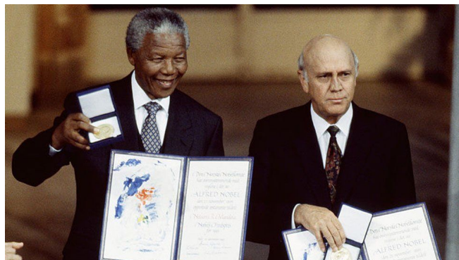
Nelson Mandela and F W de Klerk receive Nobel Peace Prize in 1993

I, without qualification, apologise for the pain and the hurt and the indignity and the damage that apartheid has done to black, brown and Indians in South Africa. I do so not only in my capacity as the former leader of the National Party, but also as an individual. Allow me in this last message to share with you the fact that since the early 80s, my views changed completely. It was as if I had a conversion. And in my heart of hearts, I realized that apartheid was wrong. I realized that we had arrived at a place which was morally unjustifiable.