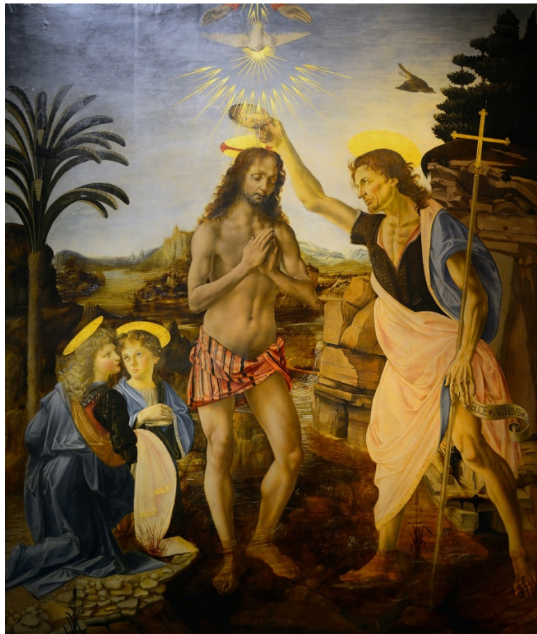
'The Baptism of Christ' by Andrea del Verrocchio

Isaiah tells us God describes us as being 'Created for my glory, whom I formed and made.' This then, is how we should come to our baptism, and if too young to comprehend that vision for ourselves, then certainly this is how we should present ourselves for Confirmation: eyes open, hearts obedient and ready to follow the Light of the World.