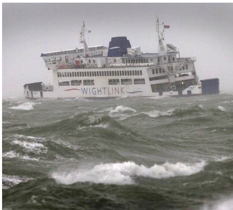
Isle of Wight ferry battles heavy seas in storm Eunice

Earlier in the week, I heard a wonderful vignette from a member of our Ministry Team who had been speaking to some young children about St Valentine. Asking them gently whether they knew what was so special about Valentine's Day, one little boy shouted out the enthusiastic reply ' Jesus! ' This toddler's emphatic answer wasn't necessarily the one being sought in that moment, but his open heart for Jesus speaks volumes. Would that we each instinctively sought Jesus as the answer to all our worldly questions!