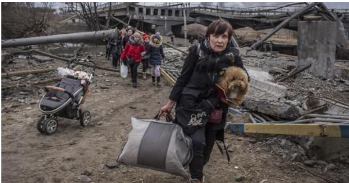
‘Ukraine - Strong explosions heard in the port of Odessa’

I’d read the service four weeks beforehand. At that time it didn’t particularly resonate with me. But then the world was a different place. On Friday the service took on a whole new meaning and relevance as we were led to reflect on the exile of the Jews from Jerusalem to Babylon that happened at the time of Isaiah (the year 586BC) and which left God’s people without a home or a Temple, and wondering if God had abandoned his promises to them. The service brought into context how terrible it was for the Jews facing exile then, and in our minds was the parallel of how awful it is for refugees being forced out of their homeland of Ukraine today. It was prophetic. The group of women who had written the service would have had no idea of what would be happening in the world on 4th March.