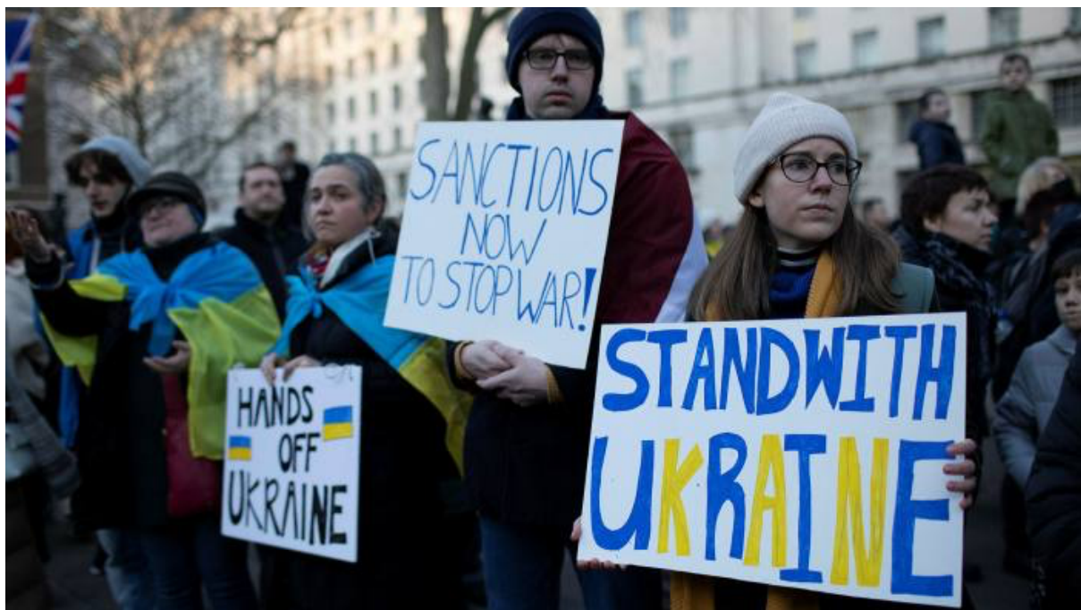
'Demonstrators gather in Downing Street to protest against Russia's invasion of Ukraine

Yet on the other hand we have also seen the best in human nature. We have seen men willing to risk their lives for their country. People from around the world have reached out in love to help refugees, especially the people of Poland. A man from Wherwell is driving a lorry filled with donations of provisions to Poland. As I write this over one and a half million people have escaped Ukraine. Last week the news showed a scene at a train station, with people holding up signs offering accommodation in their homes to refugees. People caring for one another in their greatest need. Humanity serving one another.