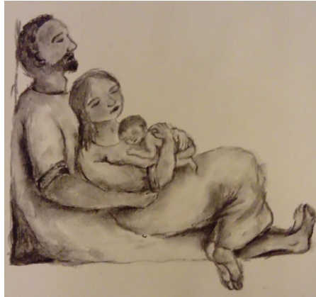
'The Holy Family' by @reverendally