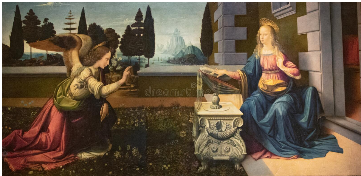
'The Annunciation' by Leonardo da Vinci

On the evening of Palm Sunday, 10 th April at 6pm, we will be holding a special Benefice Evensong for Ukraine and for World Peace in St Mary's Church, Chilbolton at 6pm. All are welcome.