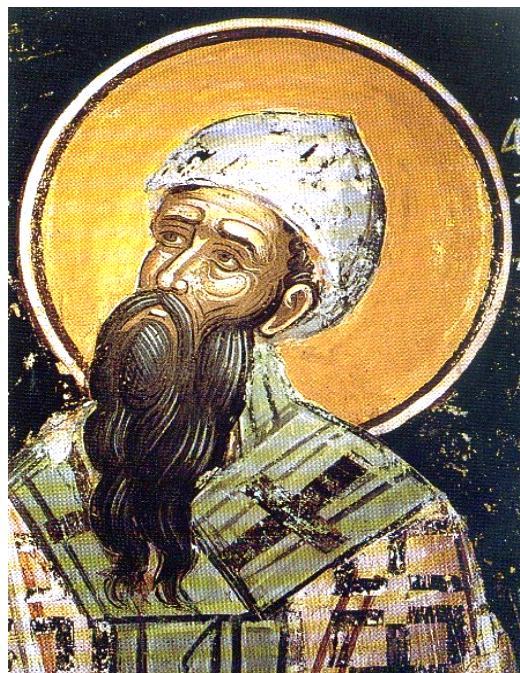
'Icon of Cyril of Alexandria - Monastery of Roussanou at Meteora, Greece'

These words were written by Cyril between the years 412 to 444 AD, when he was Patriarch of Alexandria. His thoughts could so easily be contemporaneous to our own times and speak the eternal truth of Christ's compassionate heart for us all.