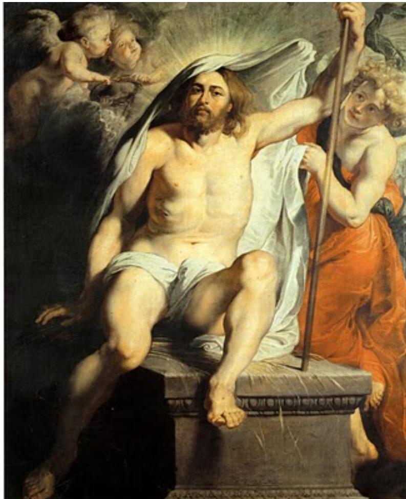
'The Resurrection of Christ' by Peter Paul Rubens

God speaks, returning to Creation – to the very point of rupture, where human beings first disobeyed Him. God is saying that He will begin all over again - describing to us what eternity will look like in His love. This new heaven and new earth will be a place of safety, and plenty; a place of peace. And it will happen through His Son, Jesus Christ.