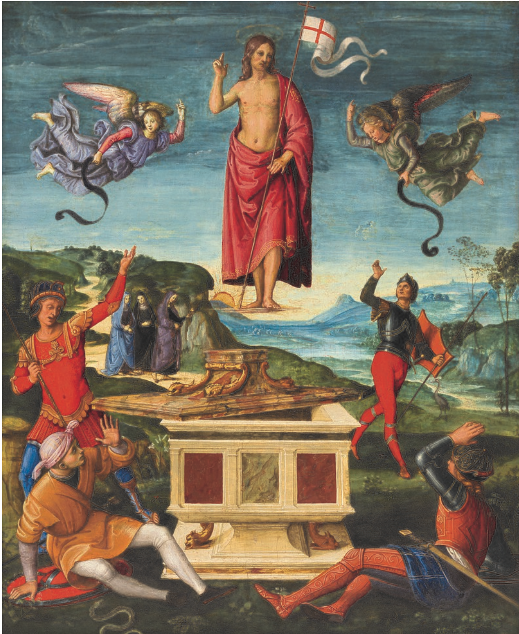
'Resurrection of Christ' by Raphael

As he too arrives to see the empty tomb, does Peter begin to be overtaken by a wild and desperate hope? Is Jesus alive? Slowly the truth dawns on him. Slowly he pieces together all that Jesus had ever told them; all the things he had ever seen and heard Jesus do. Does he dare to sense the living, thrilling presence of God that had been so much a part of Jesus' life and which seemed such a cruel joke after His death?