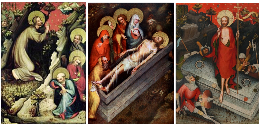
‘The Třeboň Altarpiece’

‘Imagine,’ asks John Lennon, ‘no possessions, no need for greed or hunger. Imagine all the people sharing the world...’ This is the understanding we have of the eternal life God will give to all His faithful children. It is the eternal hope we can offer to the countless innocents who are praying for deliverance from the oppression and fear of their earthly lives.