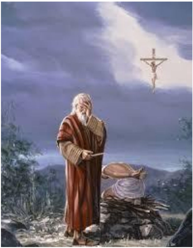
'In the Shadow of the Lamb: Jesus in Genesis 22' Apple Eye Ministries

We read this story with hindsight knowing that at the last moment God intervened. But Abraham went up the mountain in obedience, trusting God, not knowing what the end result would look like. Did he believe that God would provide an alternative sacrifice?