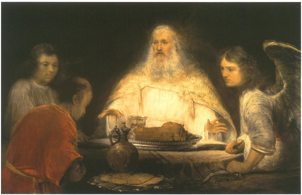
'God and the Angels visit Abraham' by Arent de Gelder

Almighty God, whose only Son has opened for us a new and living way into your presence: give us pure hearts and steadfast wills to worship you in spirit and in truth; through Jesus Christ your Son our Lord, who is alive and reigns with you, in the unity of the Holy Spirit, one God, now and for ever. Amen.