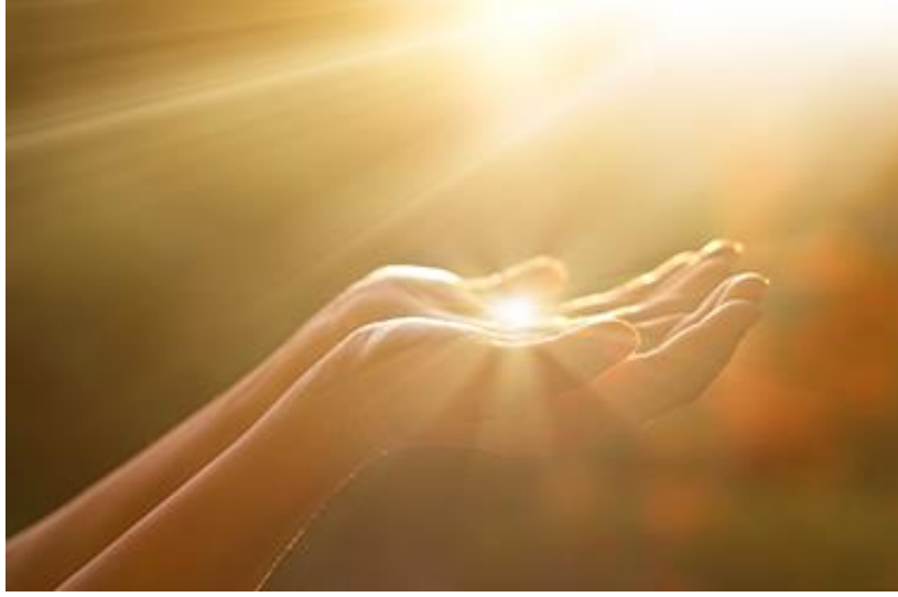
New Apostolic Church Canada

The Psalmist praises God for his greatness and his wonderful works. He spends time meditating on God's goodness. In these testing times, we can be encouraged by reflecting on God's faithfulness through stories of ordinary people in the Bible and also in our own lives and how God provides for us.