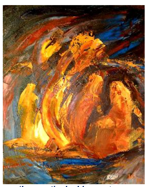
'Incarnation' - blogspot.com

Sadly, the outcome was that he used to avoid the services at which I was preaching, and I continued as a thorn in his side, exasperated as to what else there was to preach about but for the action of All Love at work in our world. Finally, he settled the matter, by giving me a copy of his own book on theology as a gift upon my Priesting. Bless him, I miss that learned man of God – both for the robust theological education he gave me and upon which I continue to draw, and for those moments when I want to share with him those liminal moments of grace where the action of All Love in and through the Holy Spirit is incontrovertible and tangible.