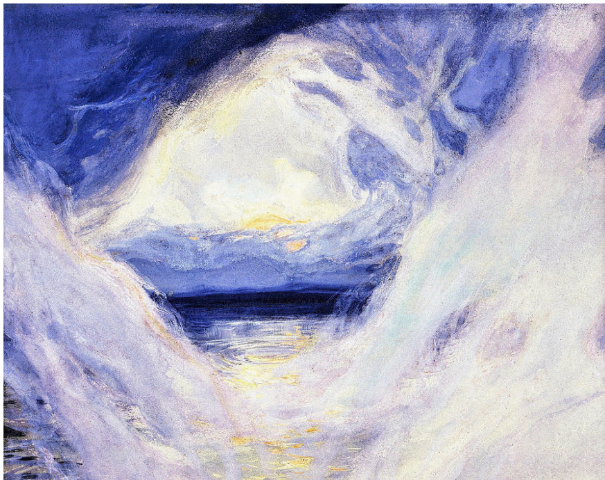
'The Creation' by James Tissot

What I do find problematic is the disparaging attitude of some in our modern times towards the faith of others, somehow being fair game to be ridiculed out of hand. In the past week alone, comedians on a radio panel show, 'The Unbelievable Truth' found a great deal to ridicule when discussing the birth of Christ, and in their self-styled 'witty, irreverent look at the world through scientist's eyes,' presenters of 'The Infinite Monkey Cage,' physicist, Brian Cox, and comedian, Robin Ince, regularly laugh outright with their guests at people of faith – particularly in response to any reference to the understanding of divine creation.