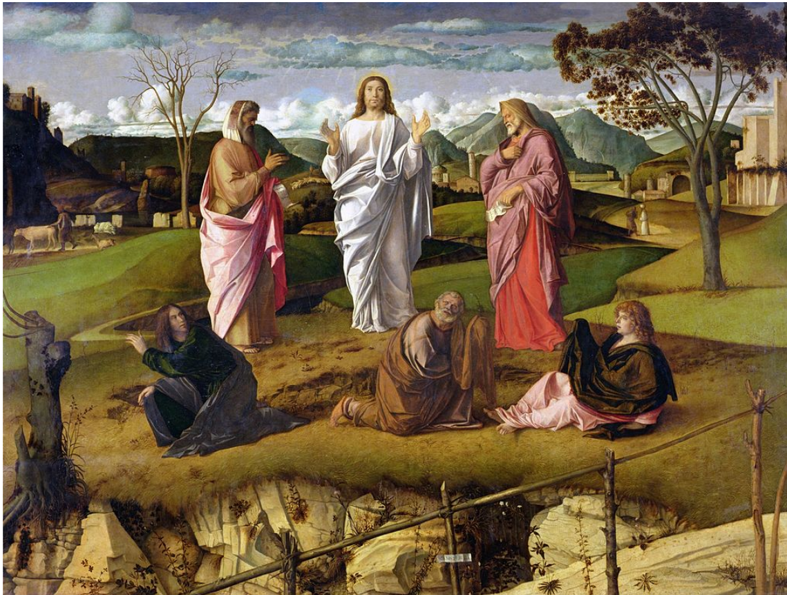
'The Transfiguration of Christ' by Giovanni Bellini

On Monday morning, as I was enjoying a cup of tea snuggled up back in bed against the cold, and wondering what to do with my day off, the 'phone rang and I found myself rapidly scrambling into priestly garb and heading up to Flowerdown Nursing Home to visit a dying resident. Unable to go inside the building, I stood in the garden outside the lady's bedroom and prayed over her through her French windows.