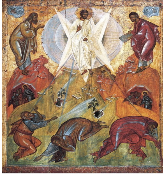
'The Transfiguration of Jesus' by Theophanes the Greek