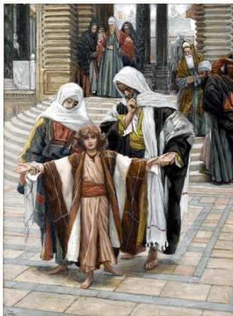
'Jesus Found in the Temple' by James Tissot

Occasionally, we were reminded of that. I remember one time when Jesus was 12 and we had been staying in Jerusalem for Passover and then travelled home. At the end of the first day's journey, we couldn't find him and so we went back to Jerusalem and searched and searched. We found him after searching for 3 days - in the synagogue, little rascal, we were worried sick. He was fine - just sitting, listening, talking, teaching. They were amazed at his understanding and what he said to them. He asked us why we were surprised at finding him there 'Did you not know that I must be in my Father's house?' he said. I remember a feeling of wonder that Jesus was my son and yet quite clearly also God's son.