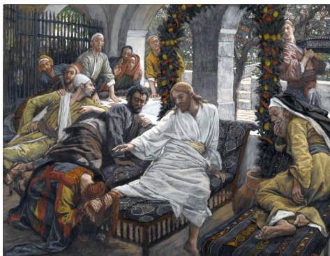
'The Ointment of the Magdalene' by James Tissot

That's why I poured perfume on him when Jesus was in Bethany. I poured perfume on his head and bathed his feet with my tears and then dried them with my hair. I just wanted to show him I loved him. I was with the others at the cross, I sat at its foot and I saw him die, I felt him die. He died even though he was God's son – I didn't really understand if I'm honest except to know it must have been God's will, God's plan. I was heartbroken – how could have God wanted his son to die?