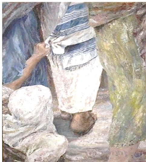
'Touching Jesus'

Later that evening, walking through the churchyard with the low full moon pendulous in the night sky, I can't help reflecting how Jesus' divine healing love was with me in that MRI scanner just as surely as the moon's bright gaze was shining upon us all from the heavens. Sometimes we are touched by the divine in mysterious yet very real ways; part of our walk of faith is to be open to the experience of such love breaking through. Reading Mark's Gospel account for this Sunday, I imagine the woman who touched Jesus' robe and Jairus the Synagogue elder felt a similar inexplicable sense of God's healing power at work in their lives.