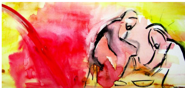
'Jesus the Servant King' – The Servant Songs