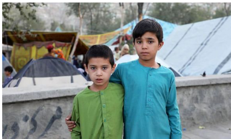
How to help Afghanistan

These are the times when our own faith must prompt us to reach out in humanitarian support in whichever way we can – whether that is by making a monetary donation to UNICEF and other refugee-supporting charities; donating items such as clothing and basic hygiene products; and writing to your MP to put pressure on the Government to allow refugees to seek shelter in the UK. And, importantly, we can pray to Jesus, our Redeemer and our guide.