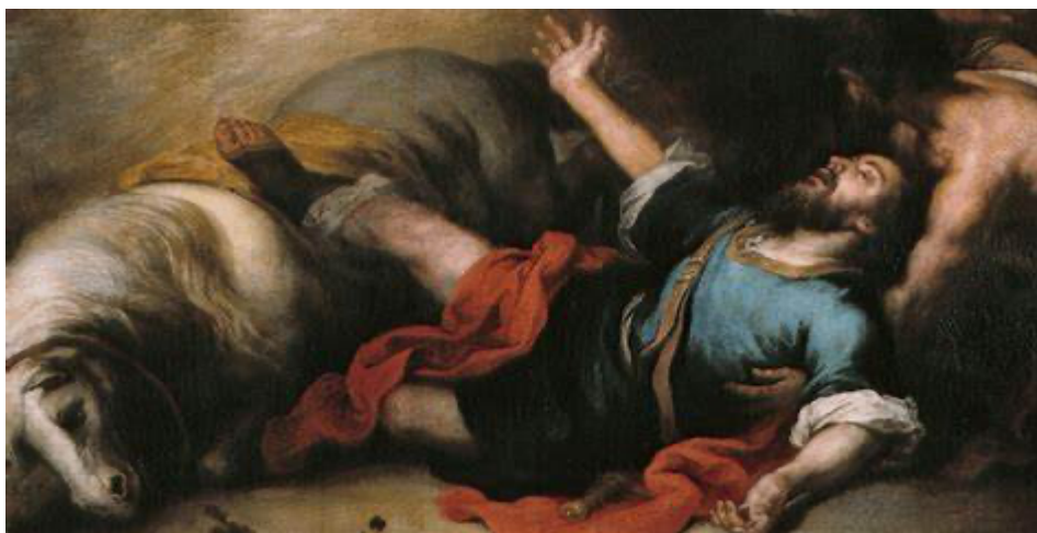
'Paul's Conversion on the Damascus Road' by Bartolome Esteban Murillo

There are several other common features of an NDE, but because this is only a Near Death Experience, at some point the angel, or Jesus, or the loving grandparent says this is not your time and you need to go back because you still have work to do. Mostly, people say they were extremely reluctant to return, but they do, and that leads to what I often find is the most interesting part of the experience.