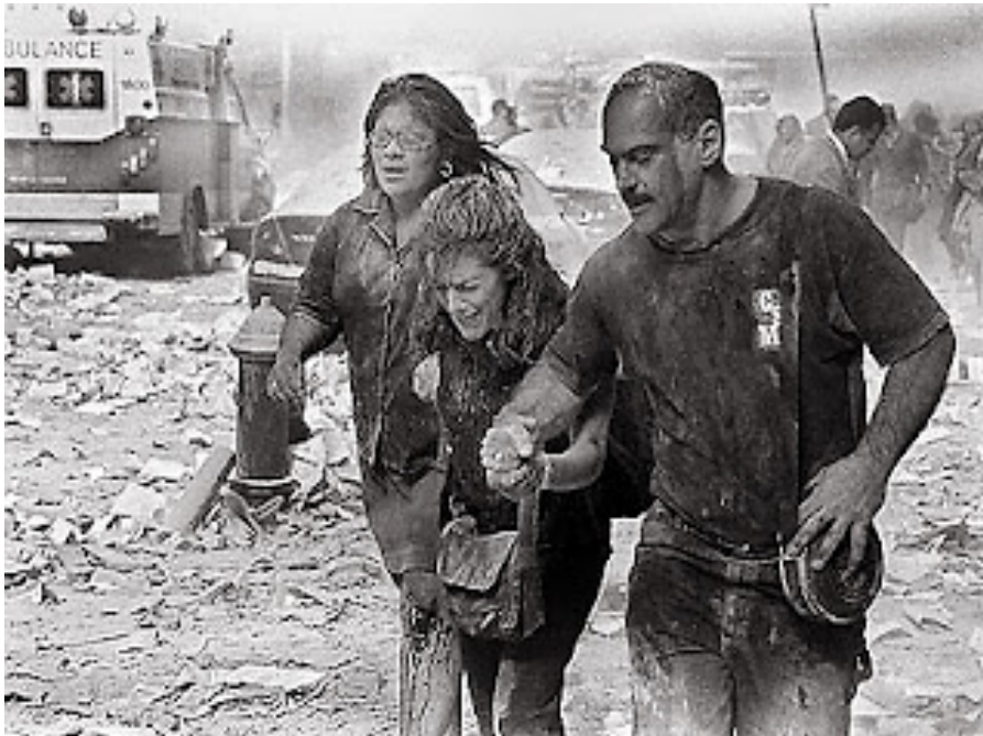
People helping each other to safety on 9/11

Beyond this time, we have known 20 years of peace in our world thanks to the protective action of peace-keeping forces; risking and giving their precious lives in the action of self-sacrificing love, communities have been taught to flourish in an understanding of what love is capable of, and our prayer now is for these lessons to continue to be learned and lived in the fragile regions of our world.