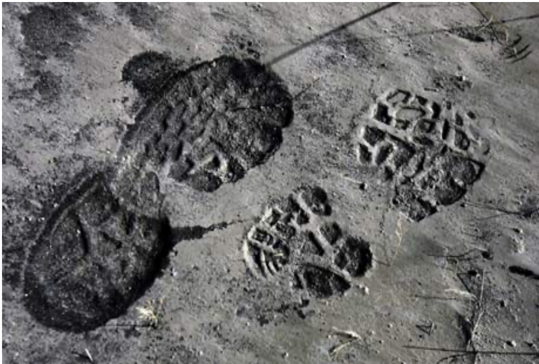
'Footprints on the grey-covered ground'

It felt to my family, as I am sure it felt to many of you as the awful day came to a close, that all we could do was lift our hearts to God in prayer – for all those who had perished, for all those who were injured; for those still searching for signs of life, and for those whose lives were plunged into the depths of grief and diminishing hope as the world watched helplessly on.