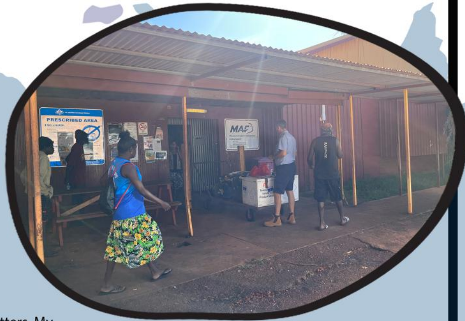
THE MAF TERMINAL AT ONE OF THE LARGER COMMUNITIES

MAF aircraft demonstrate the love of Jesus to the community in many ways. Whilst every person who travels with MAF has a story to tell, some definitely stand out and it is these stories I want to share over the next few prayer letters. My prayer is these bring to life the work in Arnhem Land and help you understand why the work of MAF is so important.