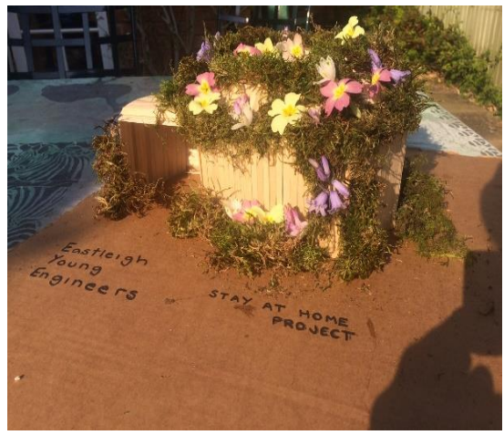
The Empty Tomb - Eastleigh Young Engineers Home Project Courtesy of Zoe Lavers in Crawley