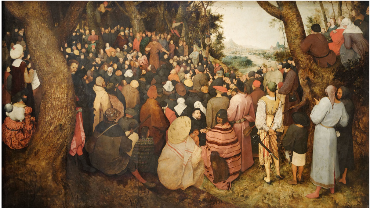
'The Preaching of St. John the Baptist' by Pieter Bruegel the Elder

Lord God, Your witness, John the Baptist, grew up strong in spirit, and prepared people for the coming of the Lord. He loved your people and baptized them in the River Jordan to wash away their sins. Help us to have the same love, that we would be witnesses to the Messiah and spread the good news of your love. As Christmas draws closer day by day, help us to be ready to welcome Jesus into our hearts. Amen.