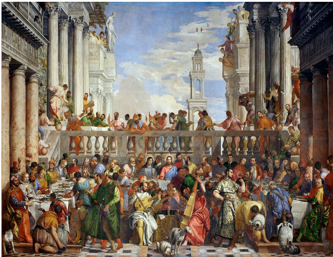
'Wedding at Cana' by Pablo Veronese

Notice Mary didn't tell Jesus what to. Instead, she recognised that Jesus was more than her earthly son – He was the Son of God. With her determined, faithful heart, she simply brought her problem to Jesus, straightaway - no procrastinating, and let Him sort the situation out the way He saw fit.