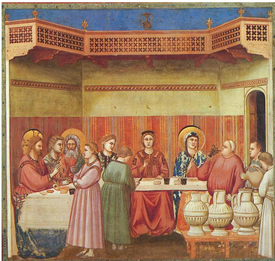
'Marriage at Cana' by Giotto di Bondone