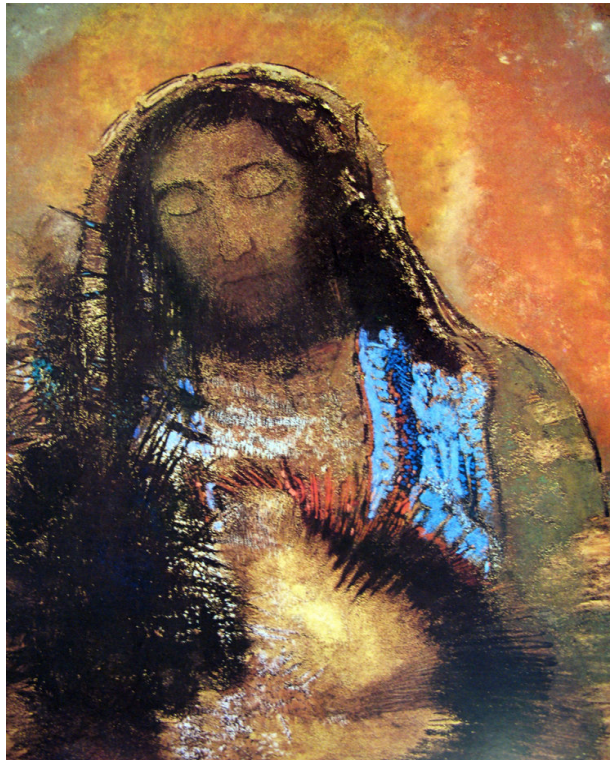
'Sacred Heart' by Odilon Redon