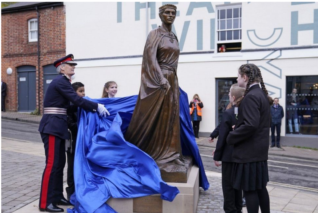
Lord Lieutenant of Hampshire unveils statue of Licoricia of Winchester

Though unable to be there for the unveiling, I am very much looking forward to going to meet Licoricia for myself. Her bronze statue, created by figurative sculptor, Ian Rank-Broadley FRSS, is depicted holding the hand of her young son, Asher, as they amble along Jewry Street; their home centuries before our being. Mother and son look remarkably lifelike. I wonder how many of us will mistake them for shoppers along this busy thoroughfare in years to come!!