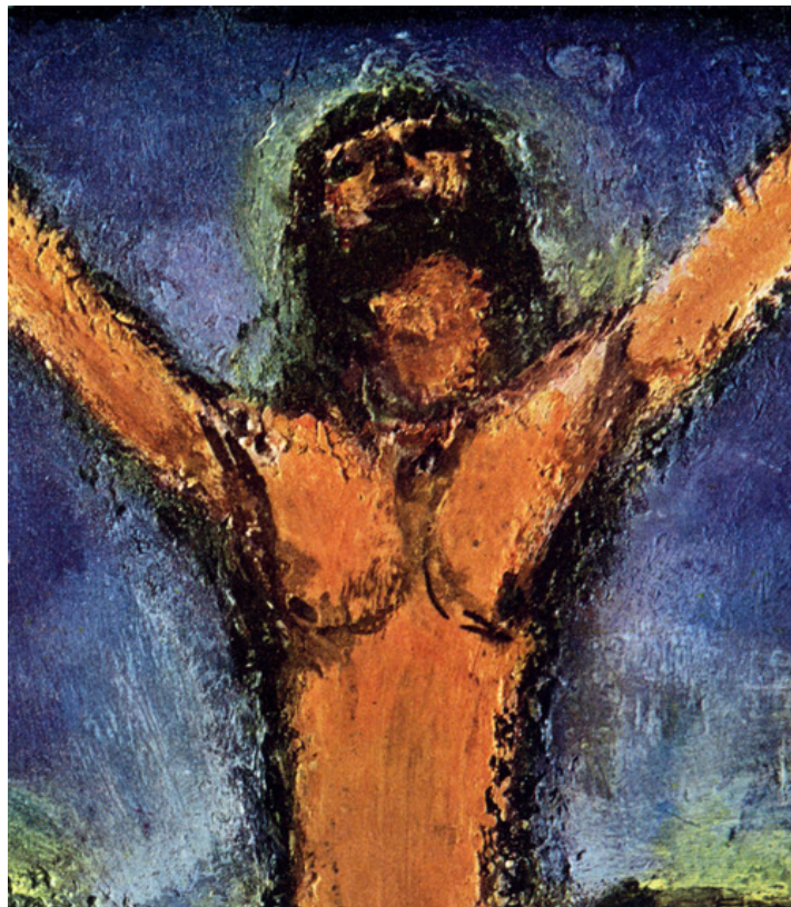
'Christ with Arms Raised' by Georges Rouault

And the clock ticks ... All the while, Lazarus watches quietly on. His very presence in the room screams out the truth. He wouldn't be there but for the miraculous intervention of Jesus in raising him from the dead. Lazarus is a witness to Jesus' power over death just as Mary is a witness to the violence and deceit into which Judas gets caught up.