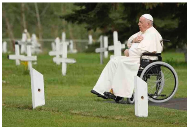
‘Pope Francis at the Ermineskin Cree Nation Cemetery in Alberta.’

Another individual out and about on their travels this past week has been Pope Francis. He has been spending a sombre time in Canada. In particular, his papal entourage has travelled north to the City of Iqaluit, where Pope Francis has focussed on the need of the Roman Catholic Church to apologise to the Inuit community there for the abuse and disrespect inflicted on many thousands of young people, many of them from the Inuit community, who attended Catholic-run boarding schools for over a century up to the 1970’s.