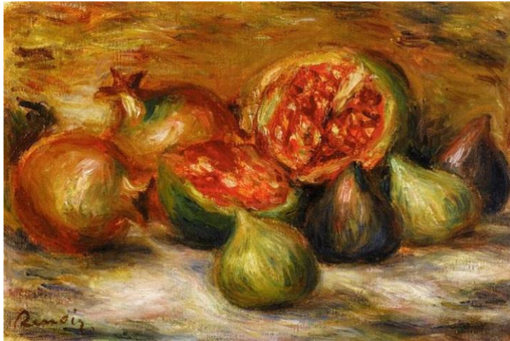
'Still Life with Figs' by Pierre Auguste Renoir

In such a moment of revelation, a simple, natural and perfectly beautiful fig has the gift of illuminating the depth of God's love for us. We are surrounded by His bountiful generosity – constant pointers to the lengths our Creator God will go to love us and sustain our lives in every dimension. All we have to do is love Him and each other for our world to be transformed.