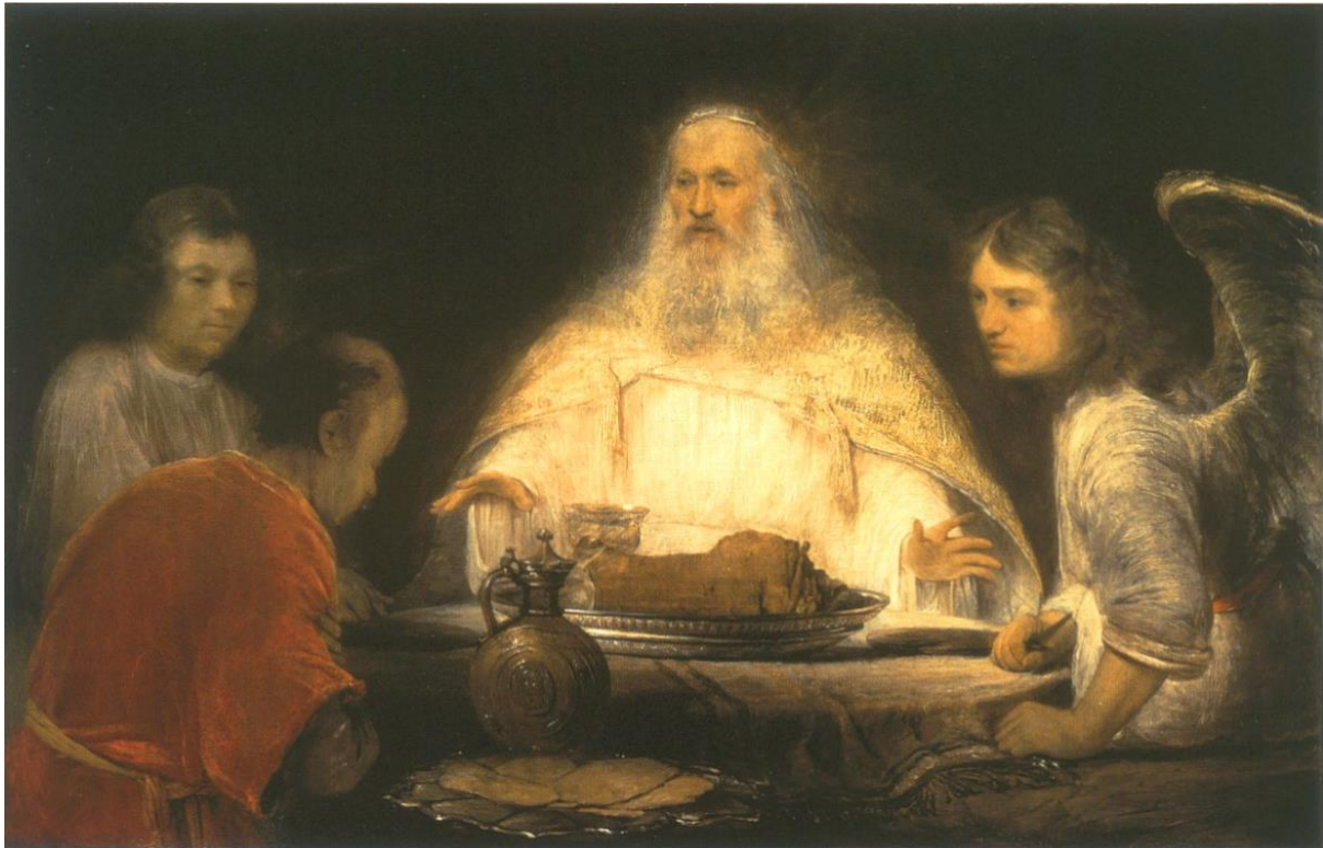
'God and the Angels visit Abraham' by Arent de Gelder

Almighty God, whose only Son has opened for us a new and living way into your presence: give us pure hearts and steadfast wills to worship you in spirit and in truth; through Jesus Christ your Son our Lord, who is alive and reigns with you, in the unity of the Holy Spirit, one God, now and for ever. Amen.