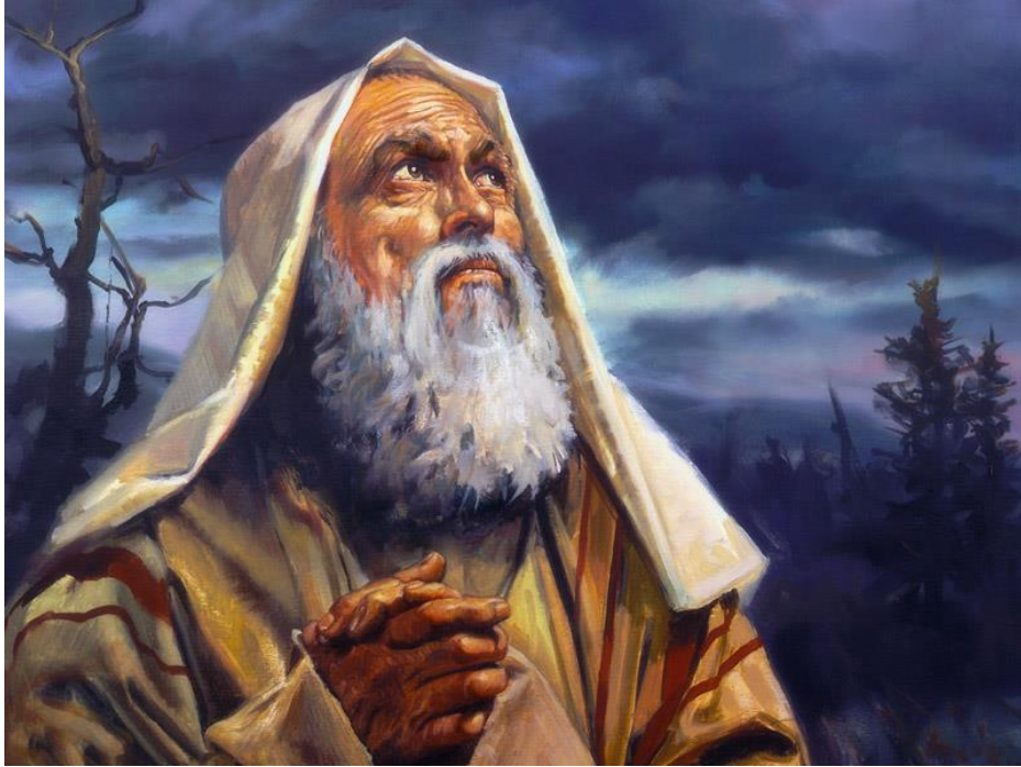
'Abraham'