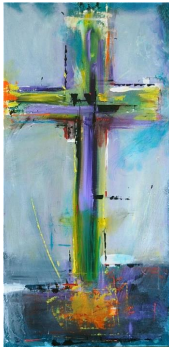
'Cross on Blue'