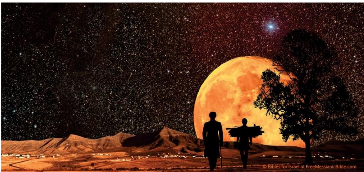
'The Messianic Prophecy Bible Project'