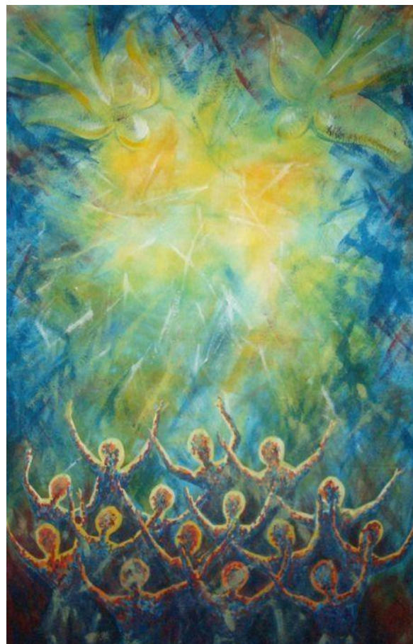
'The Communion of Saints' - source unknown

The Commemoration of the Faithful Departed also celebrates the Saints who have gone before us, yet in a more local and intimate way. It allows us to remember with thanksgiving before God those whom we have known more directly: those who gave us life, those whom we have loved, and those who have nurtured us in faith. It blesses us with space and time to come together in mutual empathy; to grieve and remember, and to lift up our emotions and hopes to God in a shared outpouring of prayer and thanksgiving for the love we have known with our beloved. We offer our hearts in prayer to God just as we offer up our pain and grief and tears, seeking Jesus' comfort and consolation in our loss; asking Him to reassure us that the eternal souls of our loved ones are safe in God's loving arms and glorying in His new life.