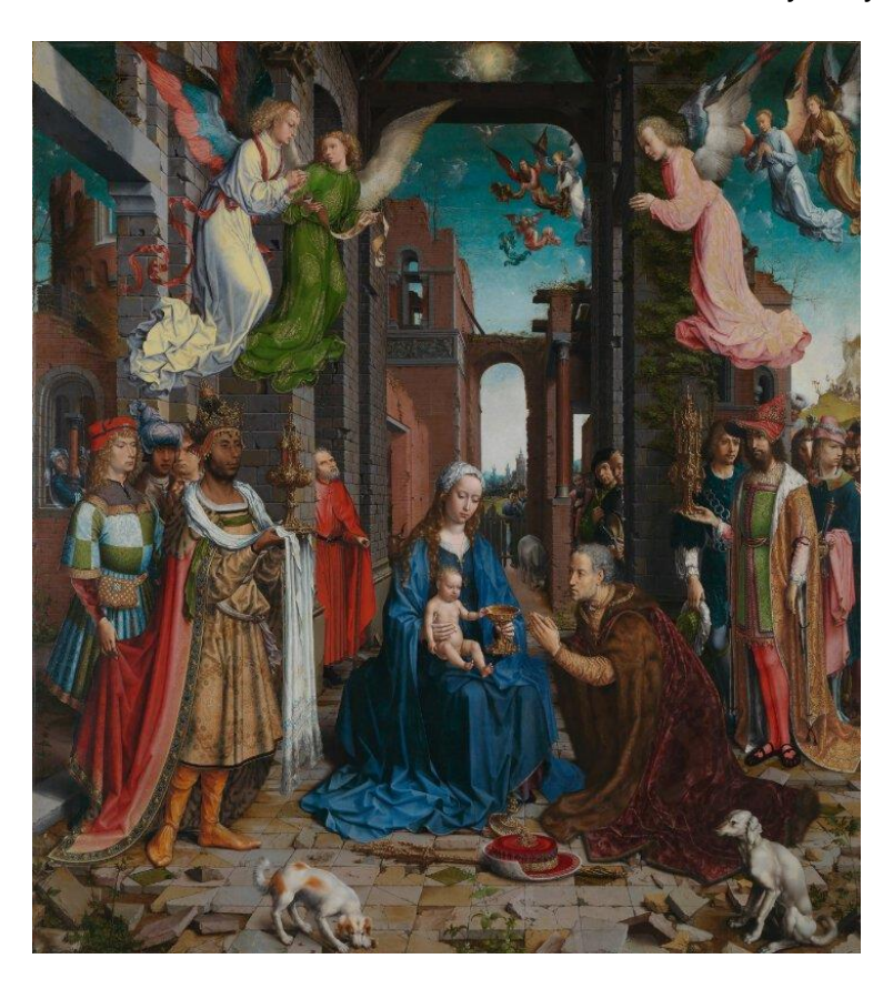
'The Adoration of the Kings' by Jan Gossaert'

Our readings for Epiphany from Isaiah and Matthew give us a sense of the exotic and mysterious! The places Isaiah mentions, Midian, Ephah and Sheba, are the homelands of obscure tribes who live deep in the Arabian Deserts from Sudan across the Red Sea to Yemen – hundreds of miles from Israel. Likewise, the Magi, who come from the East to kneel before the Christ-Child are shrouded in mystery.