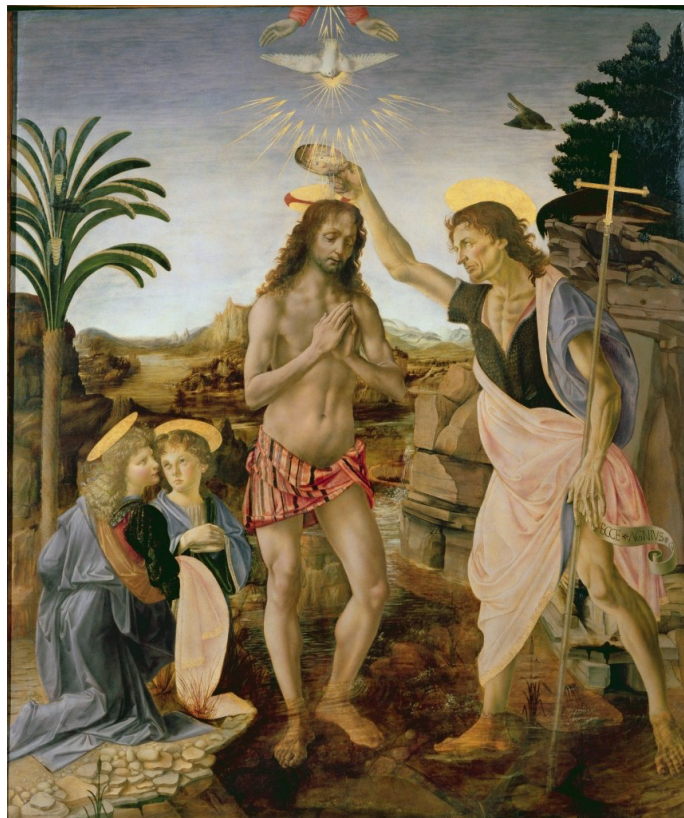
'The Baptism of Christ' by Andrea del Verrochio and his apprentice, Leonardo Da Vinci

During these six weeks of Lent, our own purpose is to do the same thing. Our repenting, in other words the re-purposing of our lives, is to find our way back through the wilderness of our wayward lives to God through Christ. It is Jesus who comes from the Father to accomplish, through His human journey, the task which will restore us all.