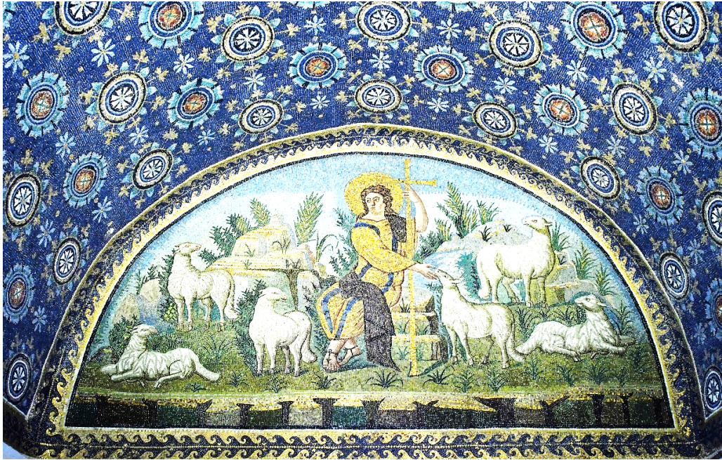
'Mosaic of the Garden of Eden and Christ the Good Shepherd' at the Mausoleum of Galla Placidia in Ravenna, Italy'

This season of Lent has been a time of preparation in our spiritual journey with Christ towards Good Friday and the joy of Easter Sunday. As we arrive on Monday of Holy Week, we are given a particular time to listen to God, as did those early writers; to look at the choices we make, and to be filled with the wonder of creation which is especially beautiful in the spring.