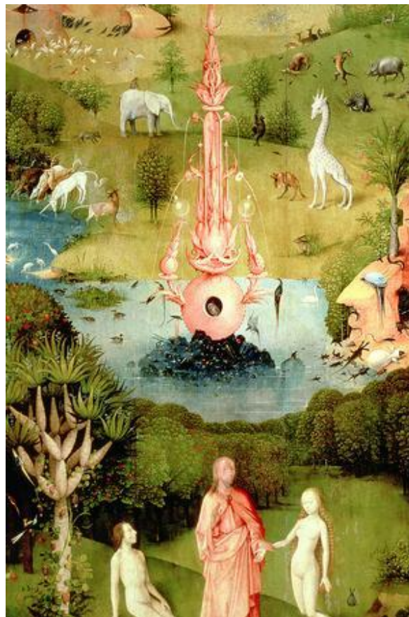
'The Joining of Adam and Eve' Left Panel from the triptych, 'The Garden of Earthly Delights,' by Hieronymus Bosch

We live in a remarkable world. Throughout the ages people have spent much time reflecting and thinking about how our planet came into being. The beginning of the book of Genesis gives us two accounts of creation, written by two writers from different times in history, and from the style of their writing we know they were storytellers and poets. They were people who listened to a trail of ancient wisdom going back through the ages. They listened to nature as they observed the sunrise, the changing seasons and the night skies. They watched. They wondered. They listened to God's creative spirit. They held a profound wonder at creation and saw everything as part of a God blessed harmony.