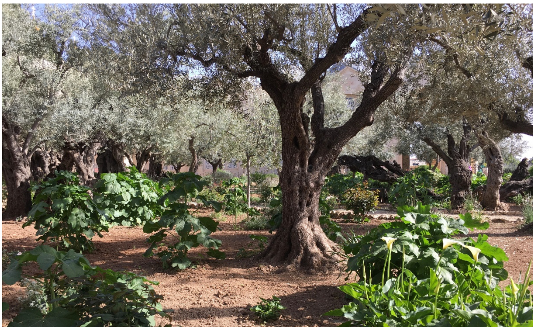
Gethsemane

Gethsemane tells us that Jesus knew exactly what He would be facing in the very near future. His Father did not forsake Him there – He strengthened Him. Many have suggested that Jesus was forsaken by God just while he was carrying the sins of the world because God was not able to look upon sin. (Sadly, this view spoils an otherwise beautiful hymn). The truth is clear; Jesus was in God, God was in Jesus throughout the whole ordeal.