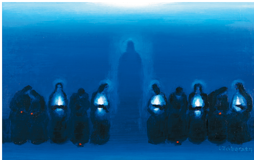
Untitled - Ladislav Záborský