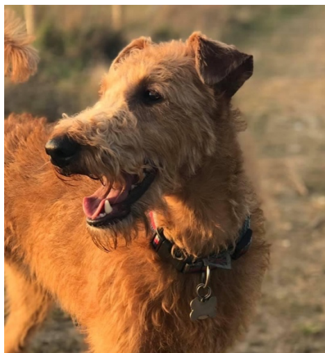
RIP Otto xxx

I wonder what sort of a week you have had. Did it go to plan? Or were your efforts and energies thwarted by unexpected curve-balls which defied even the most calculated of risk assessments? From my perspective, it's been a humbling sort of a week – a rollercoaster of emotions, in fact. Even though I appreciate the role of sport in the rich tapestry of our lives, I confess it has been hard for me to commiserate with the devastation of football fans whose teams have been knocked out of the Euros in the face of other life events going on around us. There was the news of Otto the Irish terrier, who went missing during a walk with his owners in Crawley on Friday. Many local folk helped search for him, but sadly, his lifeless body was found this Thursday morning. Others have been wrestling with news of life-changing illnesses, testing for Coronavirus, results of key exams, job interviews, moving house; and yet others the sadness of relationship breakdown or the death of a loved one. A police appeal for witnesses and dash-cam footage following a serious collision in Sparsholt between a vehicle and a cyclist further reinforces the precious fragility of our lives.