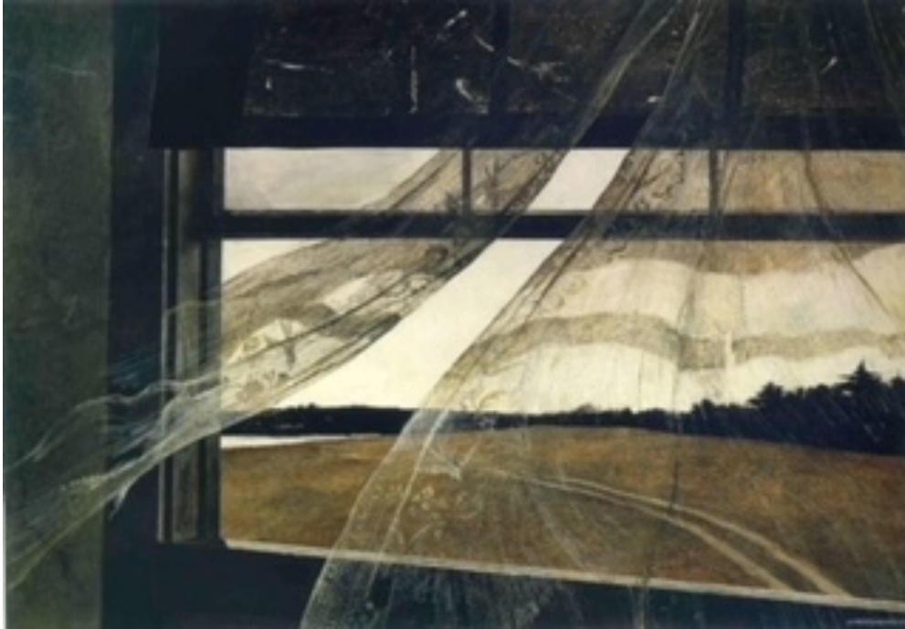
'Wind from the Sea' by Andrew Wyeth

Sometimes in our lives, even the most competent and organised of us must face turbulent storms – in relationships, health, money worries and so on. Jesus asks us to trust our lives into His own. Yet we are reticent to do so. What do we fear?