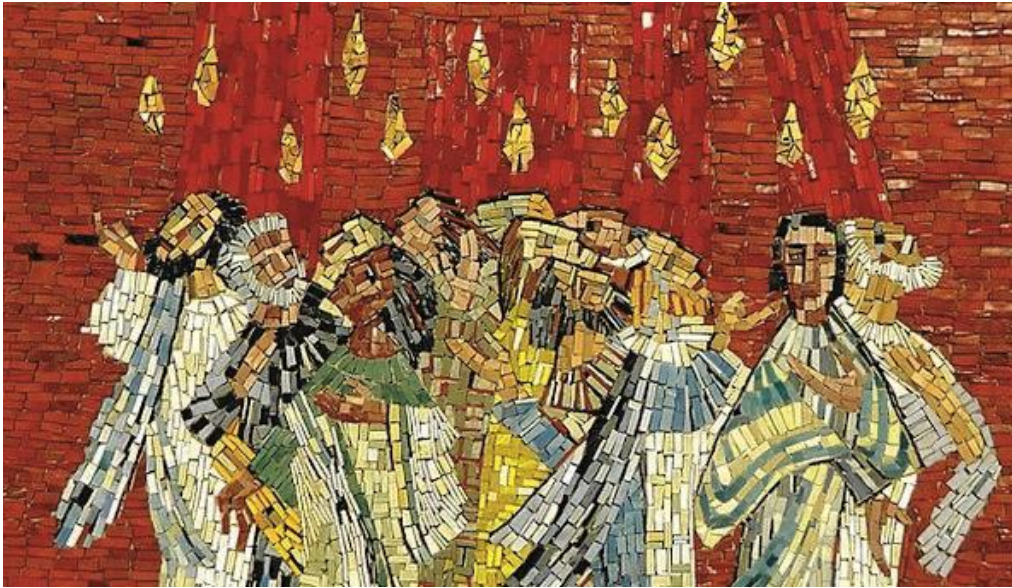
'Pentecost' from the Church of St Saviour, Armenian Patriarchate of Jerusalem