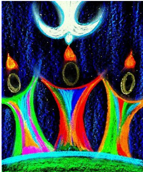
Spirit Dancers – Day of Pentecost