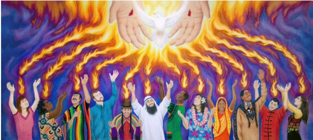
Rebecca Brogan/John the Baptist artwork

'When the day of Pentecost came, they were all together in one place. Suddenly a sound like the blowing of a violent wind came from heaven and filled the whole house where they were sitting. They saw what seemed to be tongues of fire that separated and came to rest on each of them. All of them were filled with the Holy Spirit and began to speak in other tongues as the Spirit enabled them.' (Acts 2: 1-4)