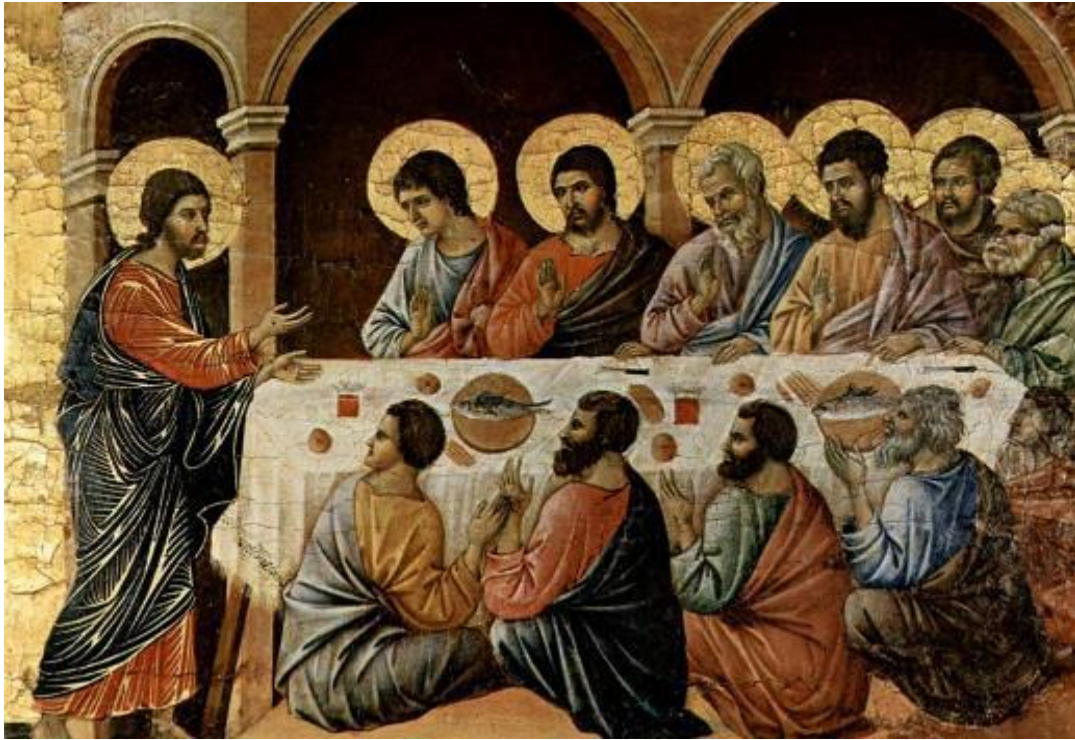
From 'The Maestà' Altarpiece in Siena Cathedral by Duccio di Buoninsegna

In the upper room on that Thursday evening, with all His beloved apostles gathered around him for their final agape meal of love, Jesus prayed, not just for his apostles, but for all disciples in every age: for you and for me, right here, right now. He prayed for us that we might continue to follow His glorious example by the way we also live: in and through Jesus in unity with our fellow Christian believers; following Him through His word; and growing the church in number as we do so. If we stay close to these commands, Jesus assures us that we will be protected from the forces of the world which strive constantly to destroy our unity with God's love.