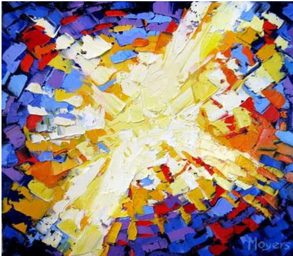
'Awake My Soul' by Mike Moyers

The more we open our hearts to God and immerse ourselves in the life-giving waters of our Baptism, we will become increasingly Christ-shaped. Being animated by generosity will become, to coin a current cliché, our ultimate 'new normal.' Emboldened by Jesus' desire for justice, we will find ourselves speaking out on behalf of the vulnerable and refusing the values of the world which Coronavirus has shown us are deeply wrong. Touched by the sacrificial love of the Perfect Shepherd, we will reach out to those in need. Motivated by compassion, perhaps we will find the courage to sit down with those who live in the shadows and discover their needs. Imagine the body of Christ fuelled only by generosity, courage, love and compassion? It is these gifts of the Spirit for which our world thirsts. It feels like now is our chance to embrace this way of life.