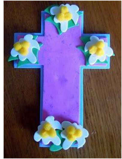
This one is made using breakfast cereal!